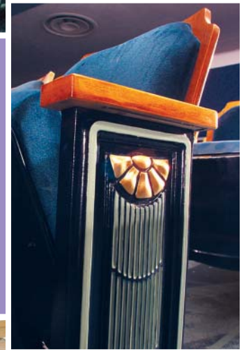
From top to bottom photo: Banquet Hall; Children's Theater/Recital Room; Albert A. White Performing Arts Theater; Dance Studio; Executive Conference Room.